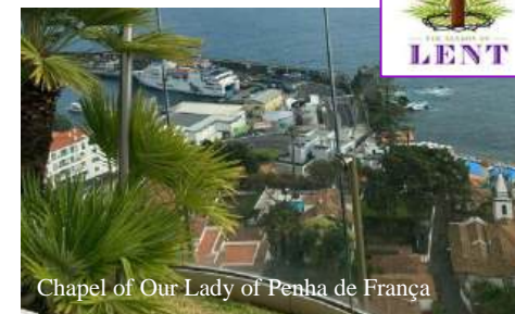
Chapel of Our Lady of Penha de França

Chapel of Our Lady of Penha de França, Rua Penha de França 3, Funchal, Madeira Website and Blog: http://rcmassmadeira.org f www.facebook.com/penhafrancachapel i www.instagram.com/capela_penha_franca/ e penhafranca.newsletter@gmail.com