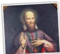
SAINT FRANCIS DE SALES

"Lent is the autumn of the spiritual life during which we gather fruit to keep us going for the rest of the year."